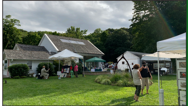
All new Farmer's and Maker's Market, September 2020

Even during the COVID-19 pandemic, the Gallery maintained this mission by creatively adapting to challenging new conditions. Since closing its doors in March, Gallery North has: