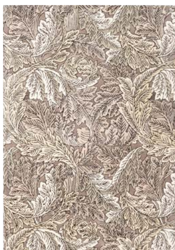
Acanthus | mole 126904