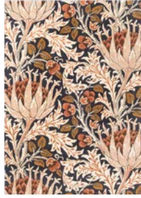
Artichoke 127103 Amber Charcoal