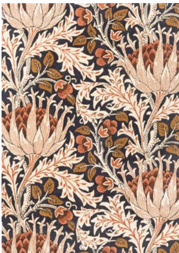
Artichoke | amber charcoal 127103