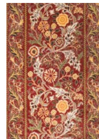
Wilhelmina 127400 Russet