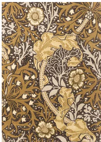
Seaweed | charcoal mustard 127006