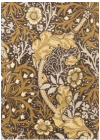
Seaweed 127006 Charcoal Mustard