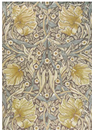
Pimpernel | bullrush 028808