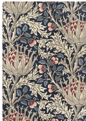
Artichoke mineral 127108