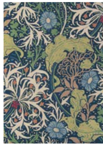
Seaweed 28008 Ink