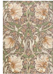
Pimpernel 028805 Aubergine