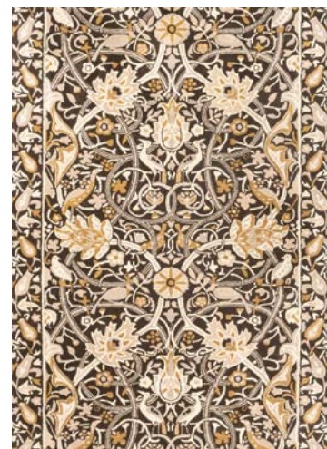
Bullerswood | charcoal mustard 127305