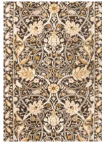
Bullerswood 127305 Charcoal Mustard