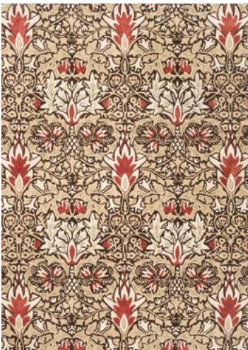
Snakeshead | chocolate spice 127200