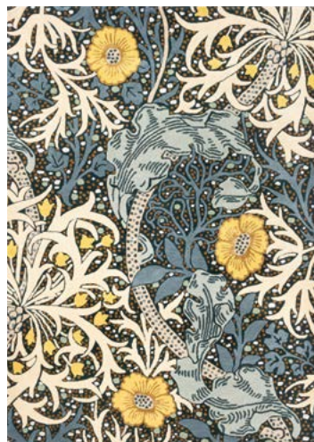
Seaweed teal 127008