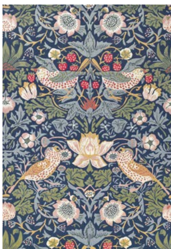
Strawberry thief | indigo 027708