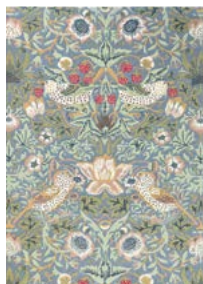
Strawberry Thief 027718 Slate