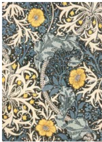
Seaweed 127008 Teal