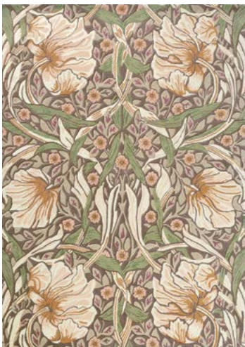
Pimpernel | aubergine 028805