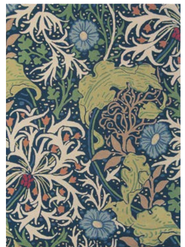
Seaweed ink 28008