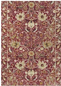
Bullerswood 127300 Red Gold