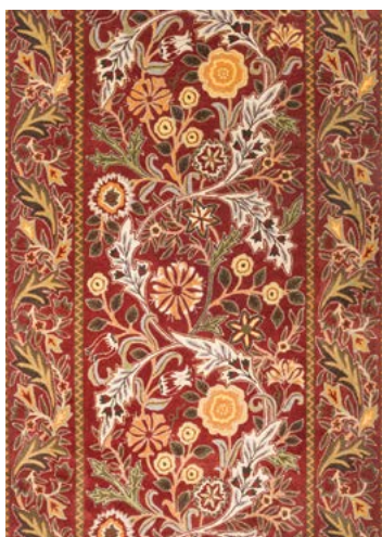
Wilhelmina | russet 127400