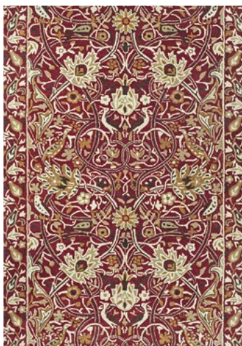
Bullerswood | red gold 127300