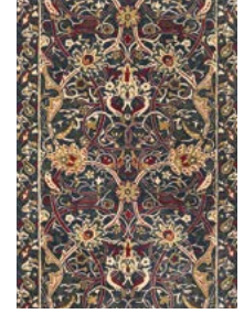
Bullerswood 127308 Indigo Red