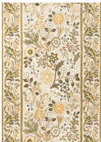
Wilhelmina | linen mustard 127401