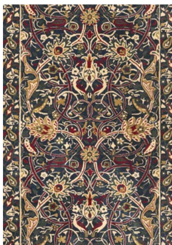
Bullerswood | indigo red 127308