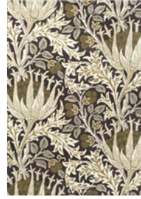
Artichoke 127105 Charcoal Mustard