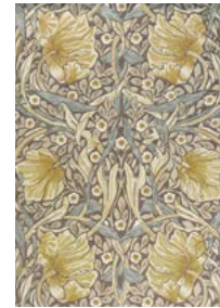
Pimpernel 028808 Bullrush