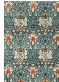
Snakeshead 127207 Thistle Russet