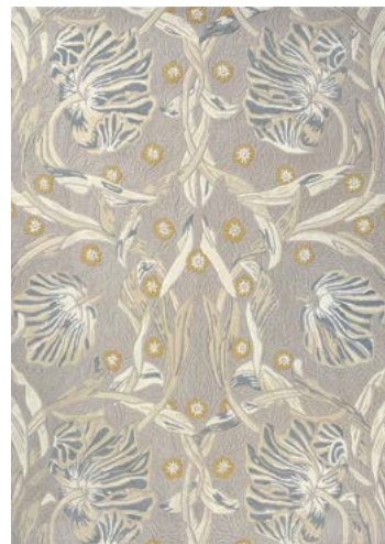
Pure Pimpernel | linen 028701