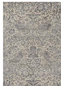
Pure Strawberry Thief 028105 Ink