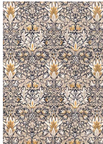
Snakeshead | indigo 127208