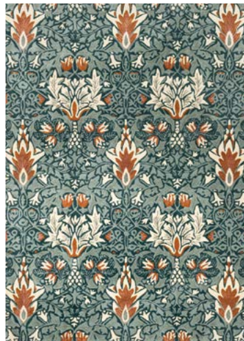
Snakeshead | thistle russet 127207