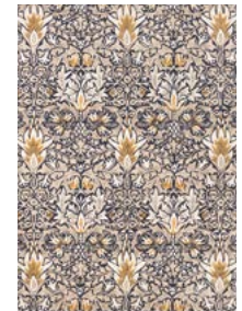
Snakeshead 127208 Indigo