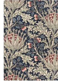
Artichoke 127108 Mineral