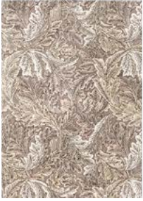
Acanthus 126904 Mole