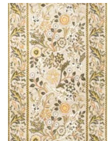
Wilhelmina 127401 Linen Mustard