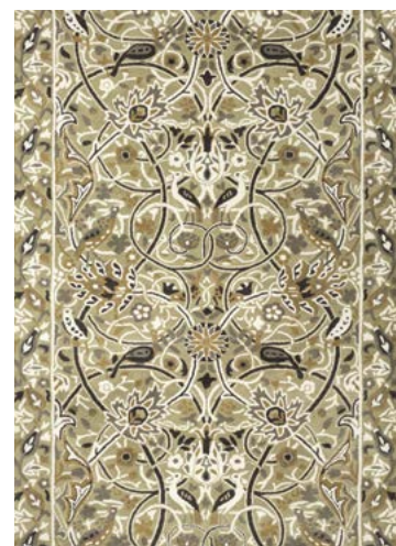
Bullerswood | stone mustard 127301