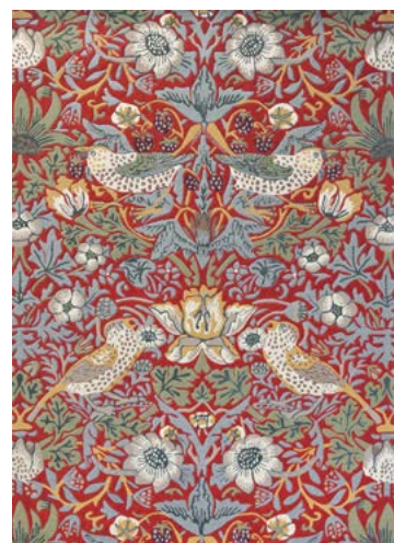
Strawberry thief | crimson 027700