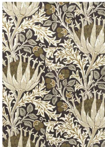
Artichoke | charcoal mustard 127105