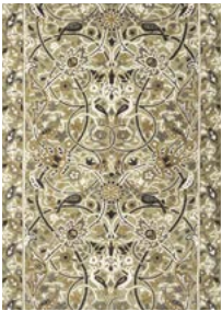
Bullerswood 127301 Stone Mustard