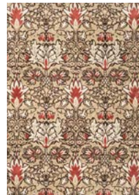
Snakeshead 127200 Chocolate Spice