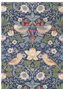
Strawberry Thief 027708 Indigo