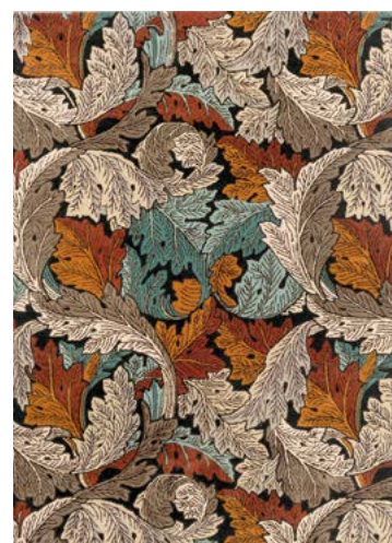
Acanthus | forest 126900