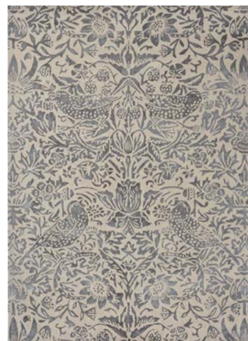
Pure Strawberry thief | ink 028105