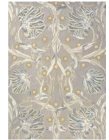
Pure Pimpernel 028701 Linen