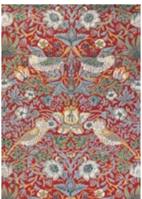
Strawberry Thief 027700 Crimson