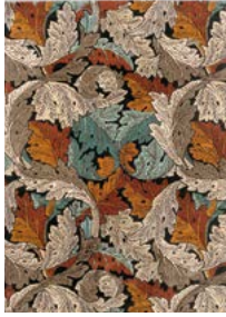
Acanthus 126900 Forest