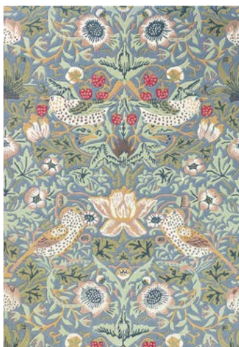
Strawberry thief | slate 027718