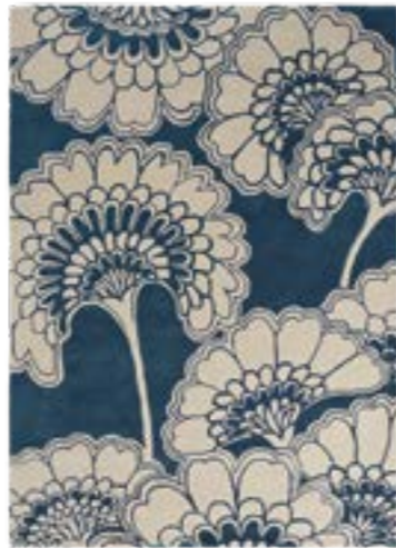
Japanese Floral Midnight 039708