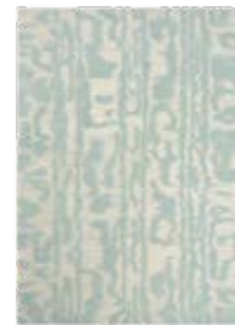
Waterwave Stripe Pearl 039908