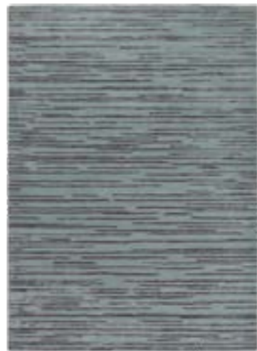
Slub Charcoal 039405