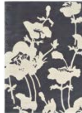
Floral 300 Charcoal 039604