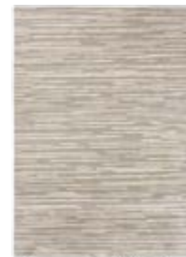
Slub Mist 039401