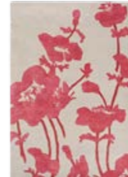
Floral 300 Poppy 039600