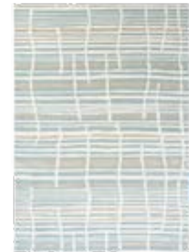
Tortoiseshell Stripe Jade 039808