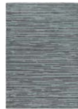
Slub Charcoal 039405