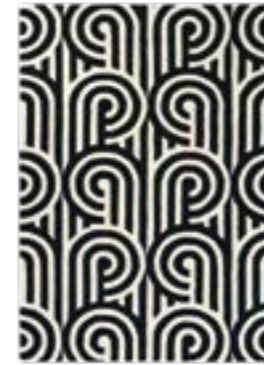
Turnabouts Black 039205