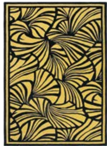
Japanese Fans Gold 039305