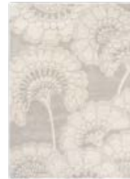
Japanese Floral Oyster 039701