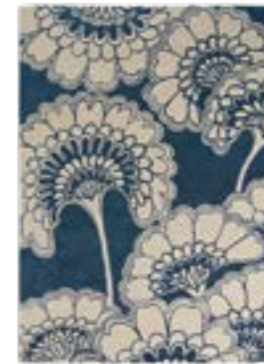
Japanese Floral Midnight 039708