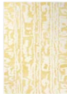
Waterwave Stripe Citron 039906