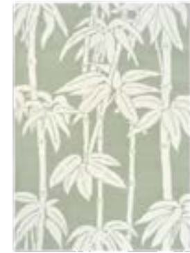
Japanese Bamboo Jade 039507