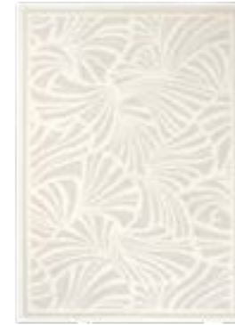
Japanese Fans Ivory 039301