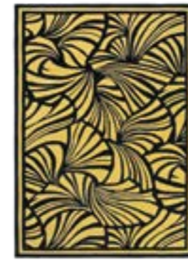
Japanese Fans Gold 039305