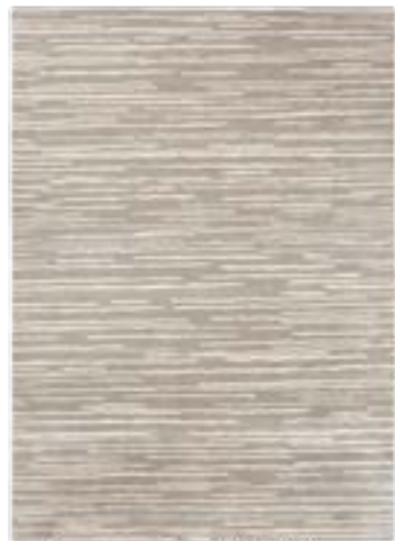
Slub Mist 039401