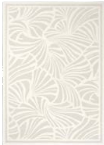
Japanese Fans Ivory 039301