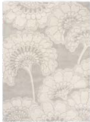
Japanese Floral Oyster 039701