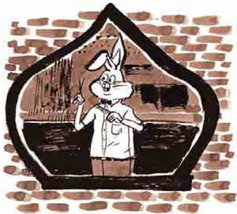
EVES BURDOY BARBER SHOP