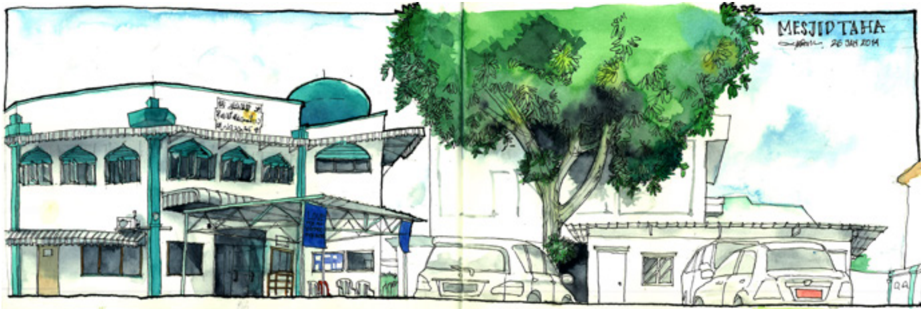
Masjid Taha on Onan Road is the only mosque for the Ahmadiyya Muslim community in Singapore. The majority of Singaporean Muslims follow Sunni Islam.