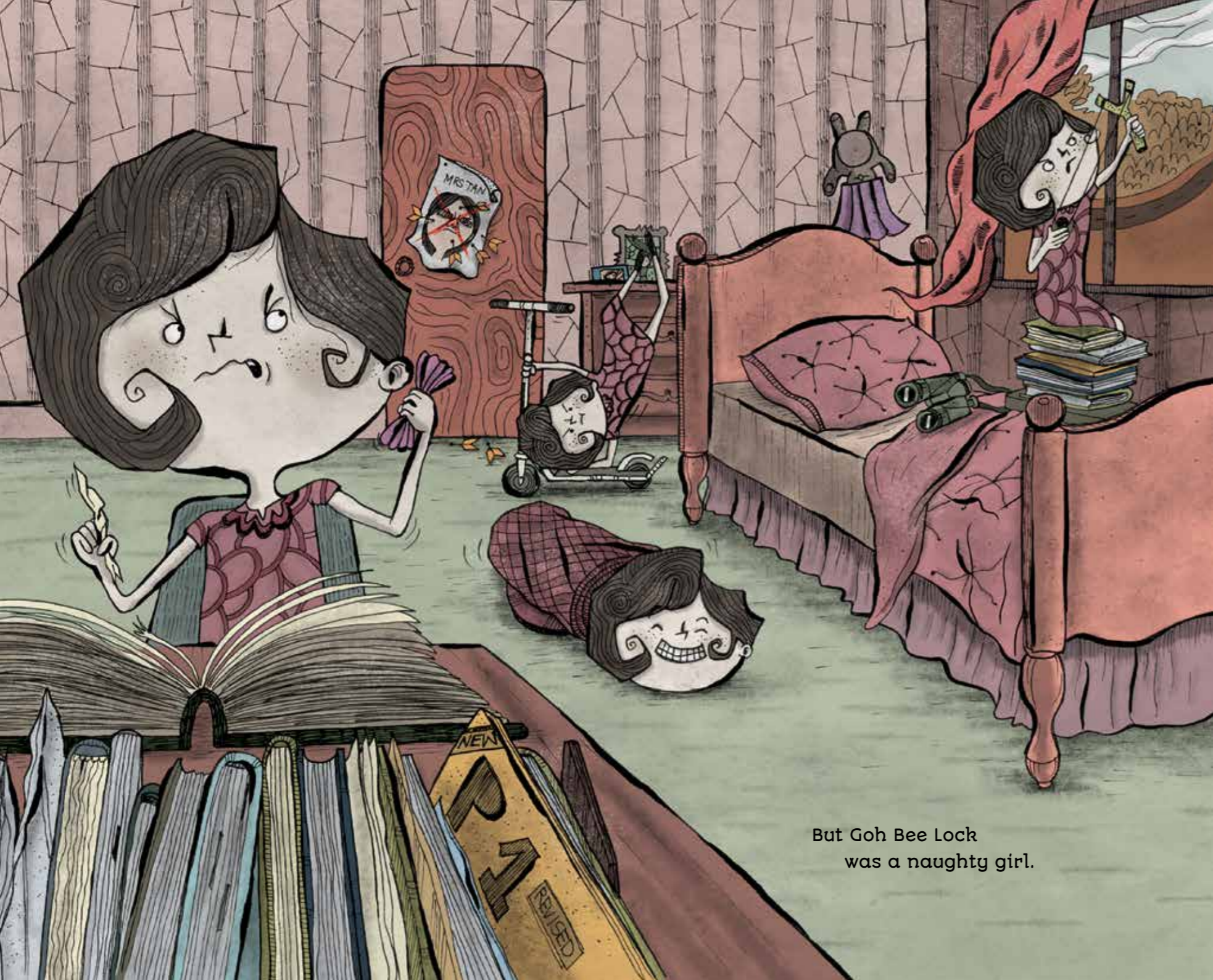
But Goh Bee Lock was a naughty girl.

One day her father locked Goh Bee Lock in her room because she wanted to run to Peirce Reservoir to play. Mr Goh left her with a tablet computer and a plate of chicken rice, and told her to study hard for her Primary One class test.