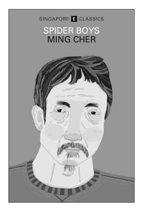
SPIDER BOYS BY MING CHER

In the 1950s, the street boys of Singapore caught and bet on their wrestling spiders, gaining not only money but also power and prestige as they won. Backgrounded against age-old vices, superstitions, urban legends, as well as a dangerous world of youth gangs and a tumultuous period in Singapore's history, Spider Boys is a moving and sensual story that draws the reader into turning its pages as if by a beguiling, hypnotic force, alternating arousing and repelling him. This edition has been re-edited to not only retain the flavour of colloquial Singapore English in the dialogue, but also improve the accessibility of the novel for all readers by rendering the narrative into grammatical Standard English.