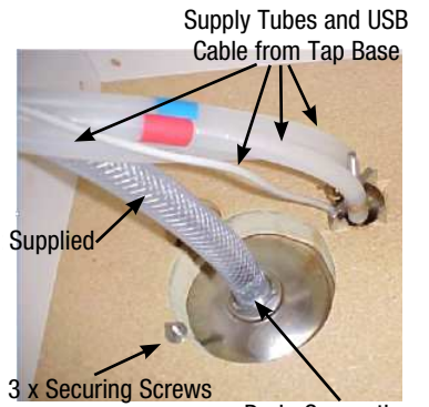
Drain Connection at Font, install supplied clamp here