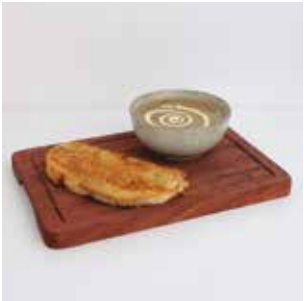
Wild Mushroom Soup