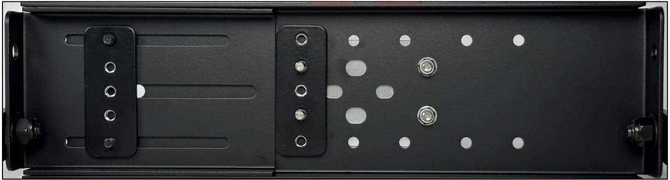
Underside of Mounting Platform with ProLock bracket installed.