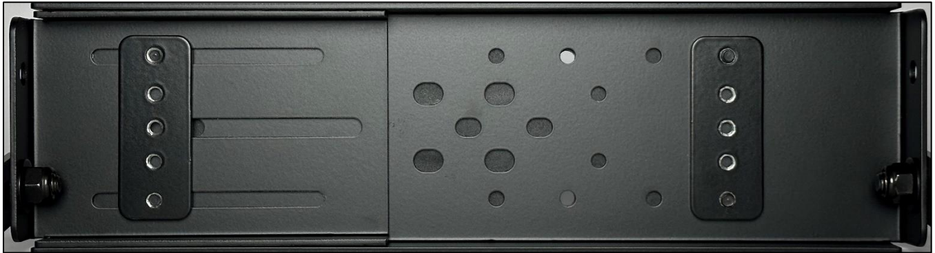
Underside of Mounting Platform with an Extreme Duty bracket installed.