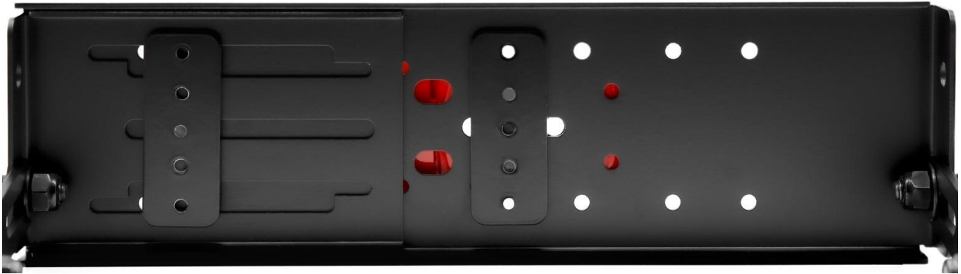
Underside of Mounting Platform with the standard bracket installed.