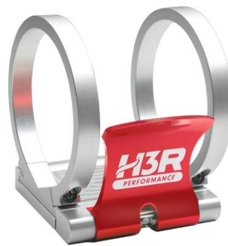
Standard ProLock bracket