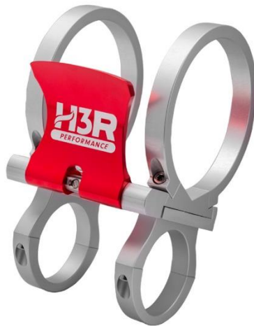
ProLock with optional roll bar add-on