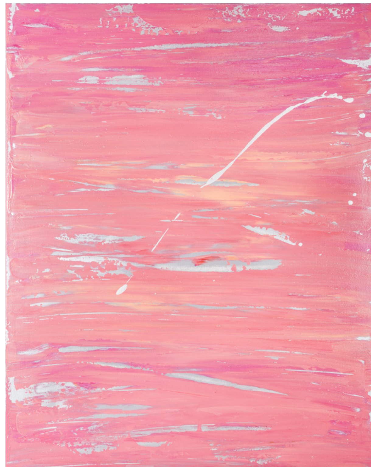
SILVER CLOUD II | 2016 LIQUID Mixed Media, Acrylics on canvas 60 x 80 cm