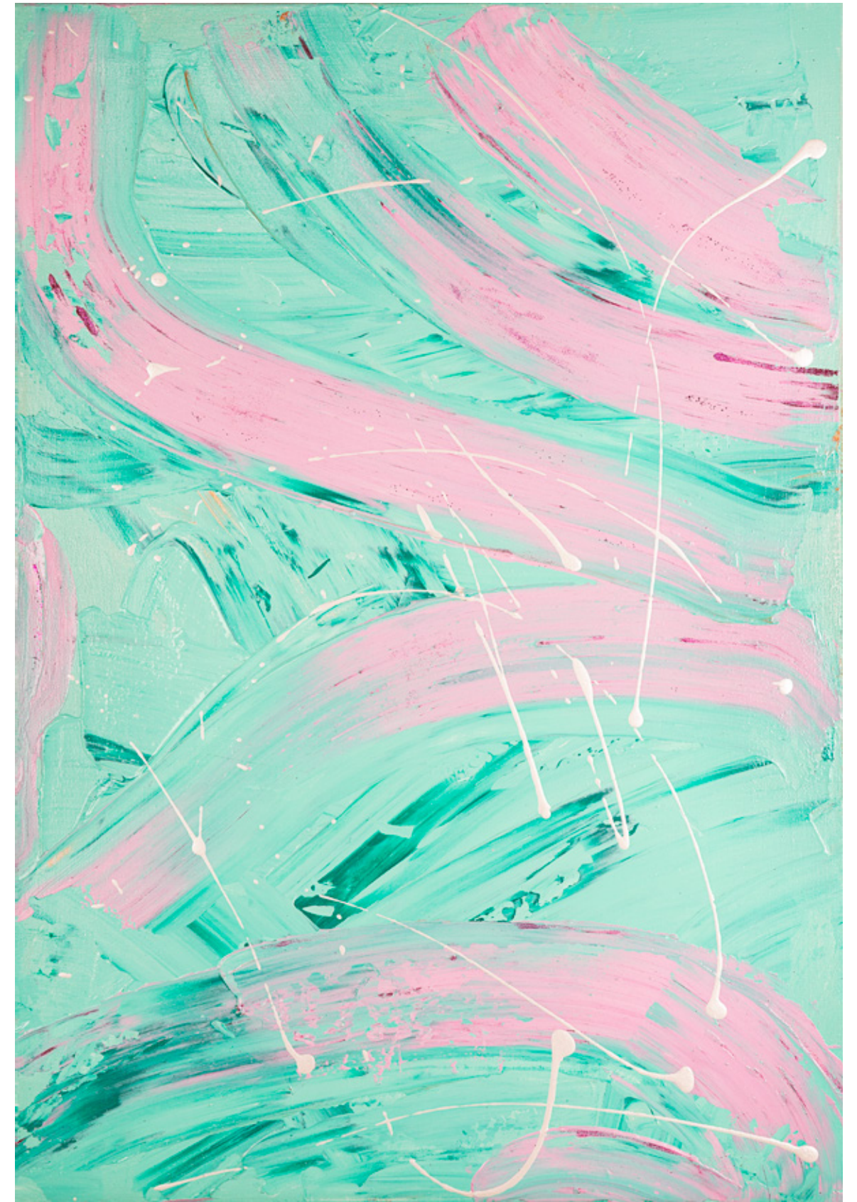
STROKES ON THE SEA | 2016 LIQUID Mixed Media, Acrylics on canvas 60 x 80 cm