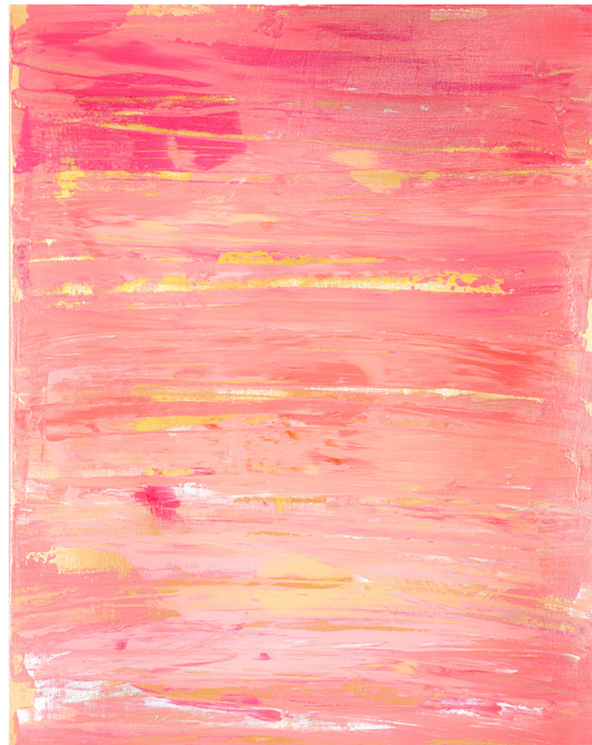
GOLDEN CLOUD | 2016 LIQUID Mixed Media, Acrylics on canvas 60 x 80 cm