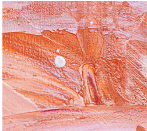
ENERGETIC STROKES | 2016 LIQUID Mixed Media, Acrylics on canvas 60 x 80 cm