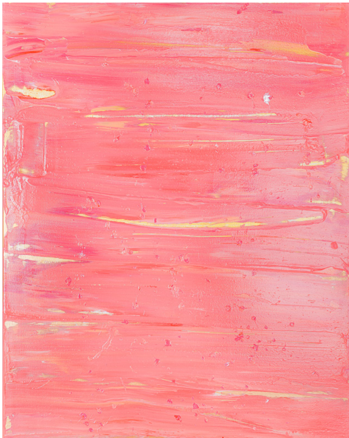
PINK HORIZON | 2016 LIQUID Mixed Media, Acrylics on canvas 60 x 80 cm