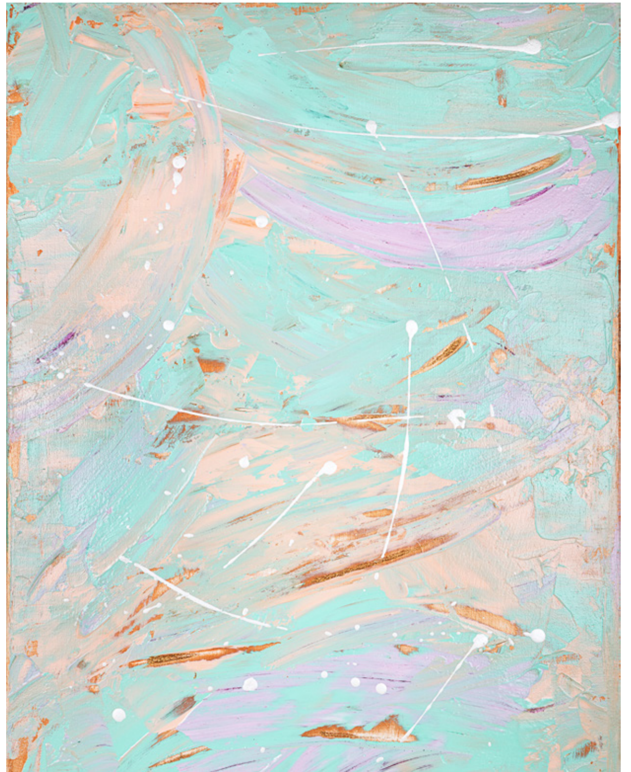
PLAYFUL STROKES | 2016 LIQUID Mixed Media, Acrylics on canvas 60 x 80 cm