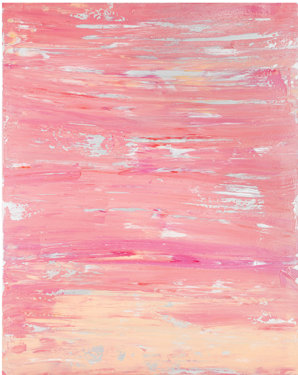
SILVER CLOUD | 2016 LIQUID Mixed Media, Acrylics on canvas 60 x 80 cm