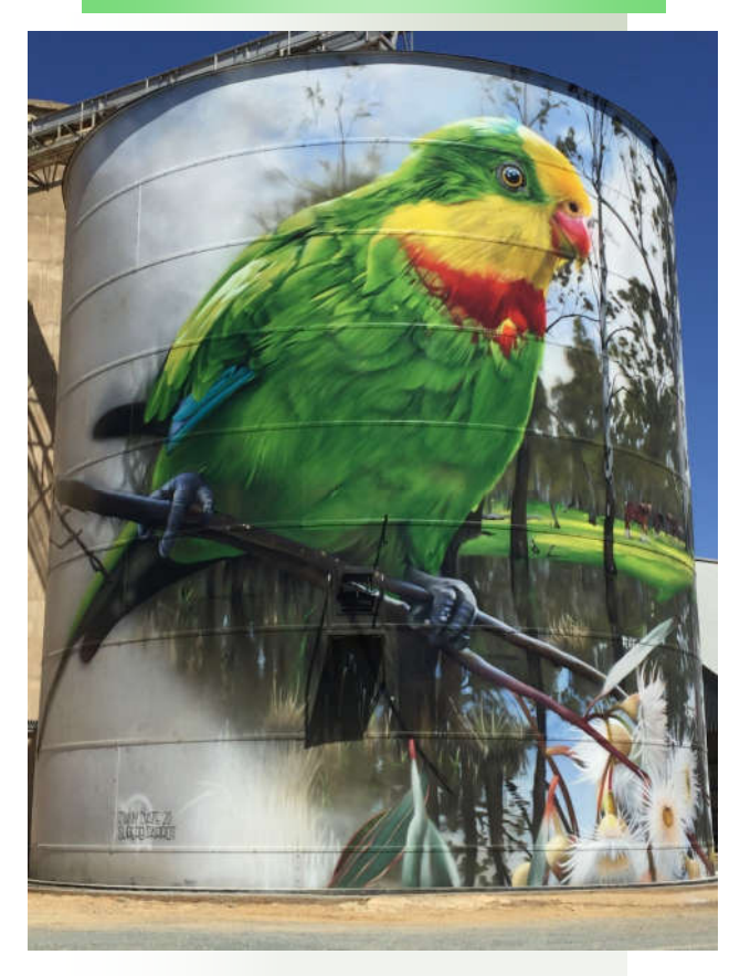
Painting of a Superb Parrot

This project was proudly produced by the Picola & District Improvement Group. 2020