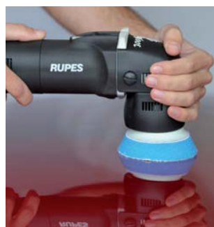
Keep the tool flat and without additional load