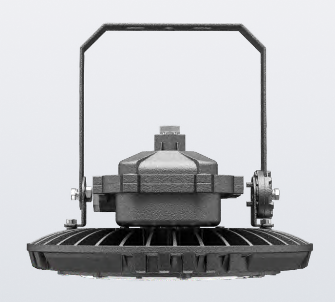
Precise Angle Rotation