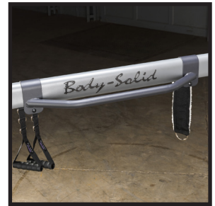
GDCCRACK Optional Accessory Rack