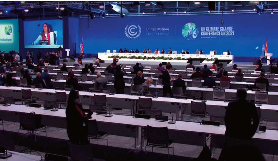
World leaders and delegates at COP 26, Glasgow, Nov 1 to 12, 2021

The UNFCCC Secretariat analyzed the NDCs submitted by the end of July 2021 and reported that the effects of the new, updated NDCs that cover about 59% of parties to the Paris Agreement and account for 49% of global greenhouse gas emissions. The good news is