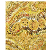
Backing 44" (111.76cm)