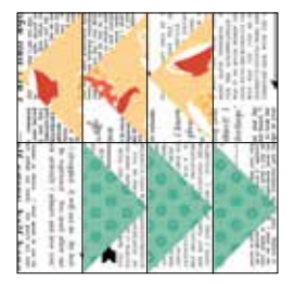
Flying Geese Block

See the block diagram for Flying Geese Unit and black text 3½" x 6½" rectangle placement. Lay out the pieces in 2 rows of 4 blocks. Sew the rows together to complete the Flying Geese Block. Repeat to create 20 Flying Geese Blocks.