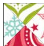
Quarter Square Triangle

Draw a diagonal line on the wrong side of 4 snow white shade 5" squares. With right sides together, place the snow white shade 5" squares on top of the red ogee 5" squares. Sew a 1/4" on each side of the drawn line. Cut on the line to make 2 Half Square Triangles. Press. Square up the Half Square Triangles to 4 1/2". Repeat to make 8 Half Square Triangles.