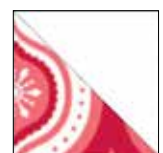
Half Square Triangle