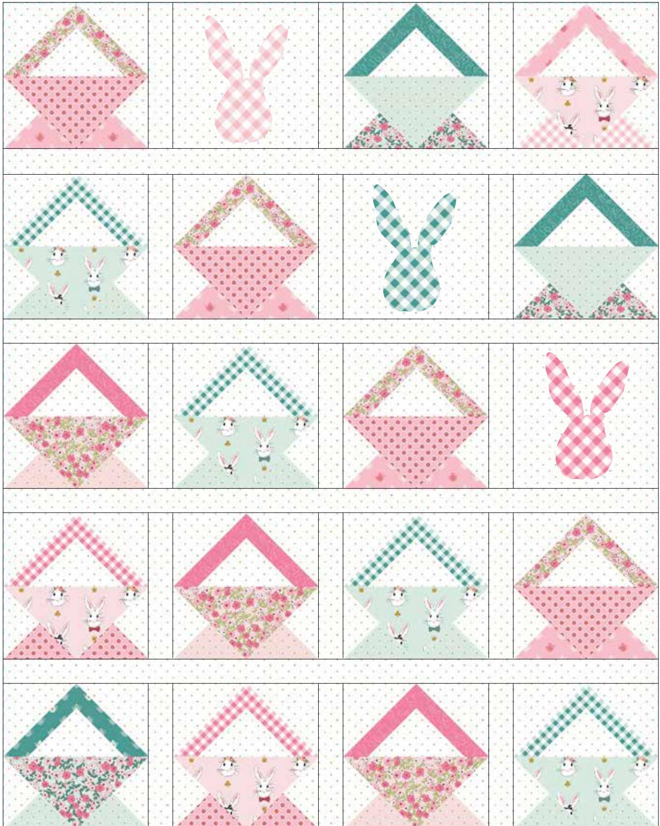
Quilt Center Diagram