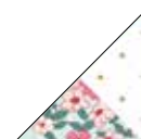
Unit B Reversed

These instructions are to make 1 block. Refer to the Quilt Center Diagram as each block is different. Sew 2 Unit As together to create a Handle Unit.