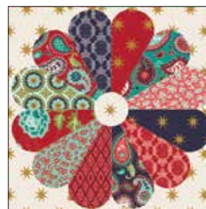
Dresden Plate Block

Refer to quilt photo for placement of Dresden blades. With right sides together, sew the sides of the blades to create the Dresden plate. Lay right side of Dresden plate on top of interfacing. Stitch ¼" around the outside edge, pivoting at the seams. Trim seam allowance, clip curves, and turn right side out. Smooth out the edges and press. Center the Dresden plate on a cream star 20½" square and attach the Dresden plate and cream star center circle using your favorite method of applique. Repeat to make 4 Dresden Plate Blocks.