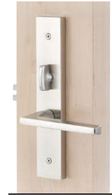
Interior trim view

To order: Function + Product Code + Backset + Knob/Lever Style + Handing + Finish + Add Door Thickness to Comments