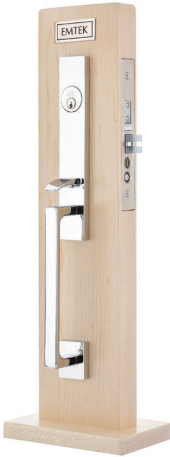
ANSI F13 Adelaide Mortise