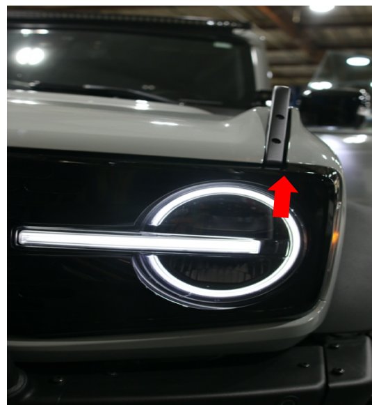
TOO MUCH GAP FROM FENDER