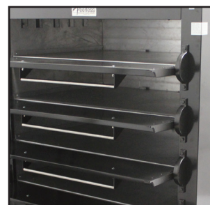
Adjustable Dampers at each deck