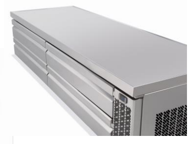
AISI 304 Stainless Steel worktop with drip guard marine edge, standard.