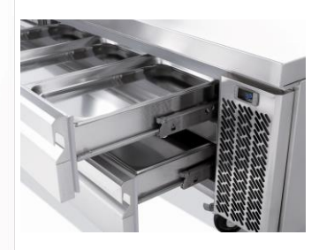
Heavy-duty stainless-steel drawer slides designed to hold up to 440 Lbs. (Pans Not Included)