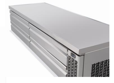
AISI 304 Stainless Steel worktop with drip guard marine edge, standard.