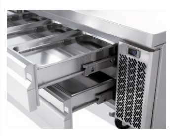
Heavy-duty stainless-steel drawer slides designed to hold up to 440 Lbs. (Pans Not Included)