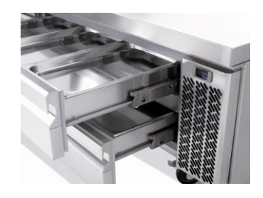
Heavy-duty stainless-steel drawer slides designed to hold up to 440 Lbs. (Pans not Included)