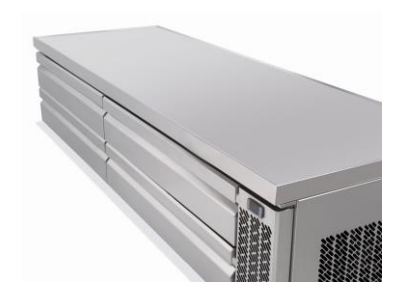
AISI 304 Stainless Steel worktop with drip guard marine edge, standard.