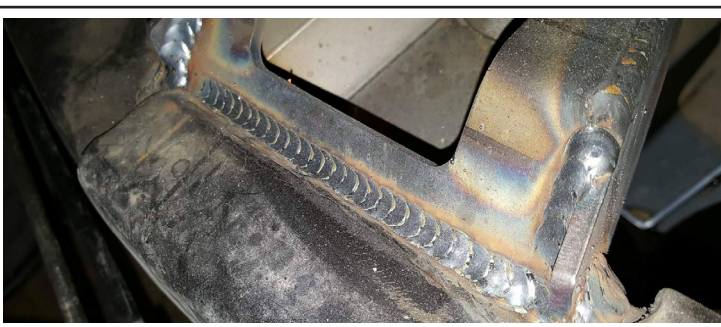
STEP 6. If you have purchased our aluminum body mount spacer kit for the remaining body mounts now would be a good time to install that as well. After the all the mounts have been installed perform a final torque of all the bolts.

7/16" bolts Torque (35 FT/LBS) 1/2" bolts Torque (50 FT/LBS)