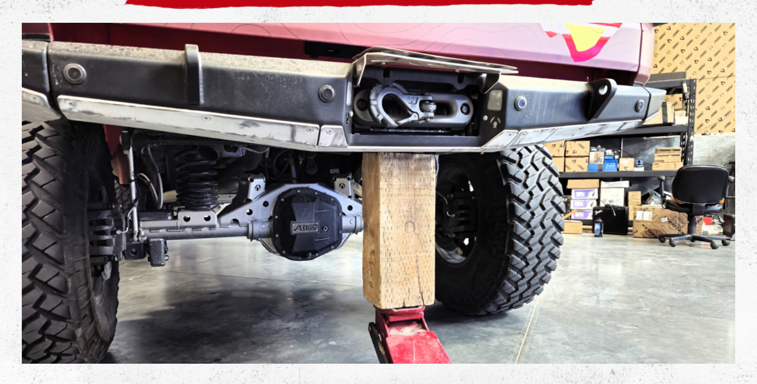
Step 1: Use a jack or other means to align your winch and winchplate to the high clearance bumper.