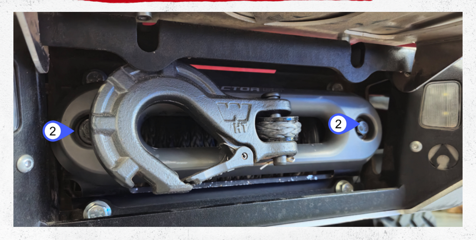
Step 3: Install your fair-lead onto the winch using BLUE 2 and tighten all components.