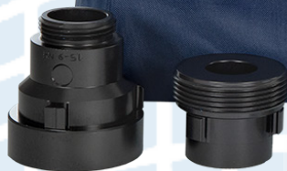
1.5" X 2.5" (38 X 65 mm) Increaser