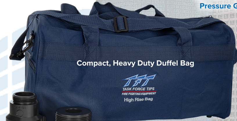
2.5" X 1.5" (65 X 38 mm) Reducer