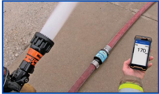
See Your Accurate Flow in Real Time with TFT's SHO-FLOW, which is substantially more compact than competitive models.

The SHO-FLOW Bluetooth is an accurate, compact, flow meter that will display your flow in an instant and totalize in real time.