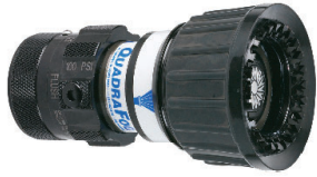
FQ125F TIP ONLY