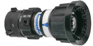
FT200F TIP ONLY

The QUADRAFOG AND THUNDERFOG series are economical and lightweight selectable gallonage nozzles in 1" (25mm), 1.5" (38mm), and 2.5" (65mm) sizes. Models are available in various flow and pressure choices and are suitable for use with low-expansion or multi-expansion foam attachments. All units are NFPA 1964 compliant, include flush without shutting down, and are available in tip-only configurations or with a stainless steel ball shutoff.