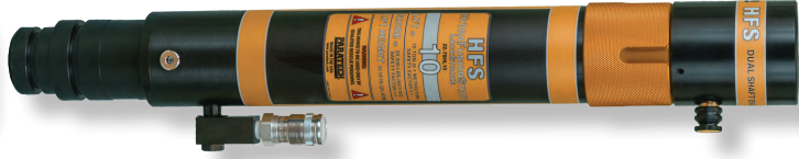
HFS 10: lifts 10 inches (25.4 cm)