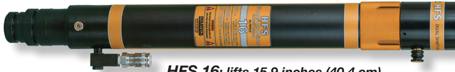
HFS 16: lifts 15.9 inches (40.4 cm)