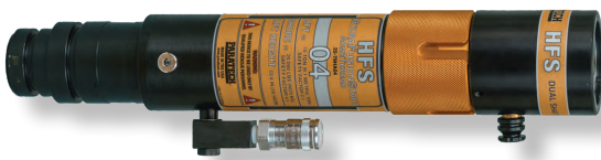
HFS 04: lifts 4 inches (10.2 cm)

All shore 20,000 lbs. (9.0 mt) with a 4:1 safety factor