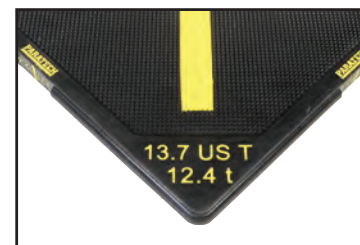
HIGH VISIBILITY MARKINGS