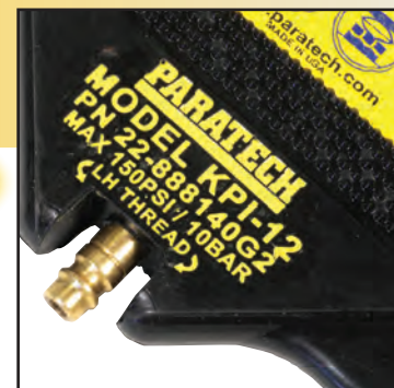
RECESSED AIR INLET FOR ADDED DURABILITY