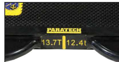
EASY AND ACCURATE POSITIONING

The MAXIFORCE® AIR LIFTING BAG is a thin, strong, molded envelope available in 14 different sizes.