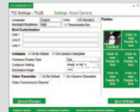
Camera configuration application