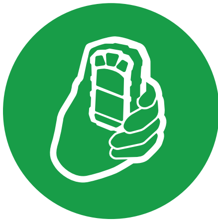
Best-in-class MSA Detectors