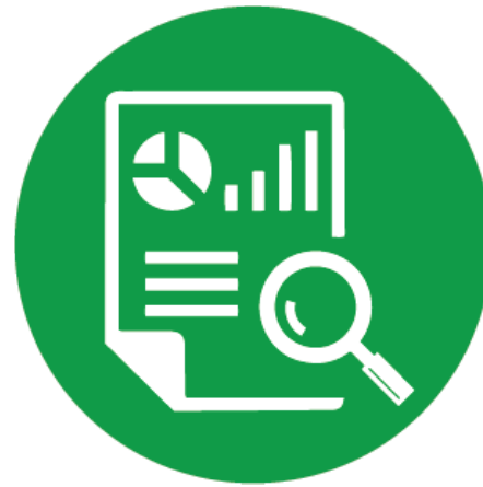
Insights of the Safety io Grid Services