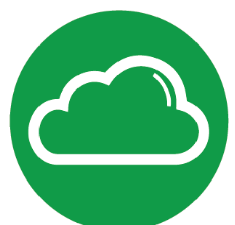
Effortlessly create connected worksites and improved safety outcomes.