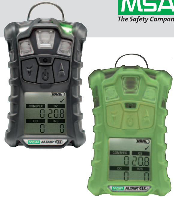
ALTAIR 4X Multigas Detector – charcoal (left) and phosphorescent (right)

ALTAIR 4X Detector with North American approval, quick-start card, data logging, charger, calibration cap and tubing, CD manual. MotionAlert™ feature is now standard on all detectors.