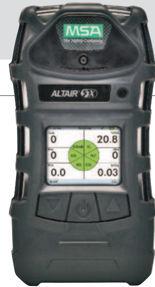
ALTAIR 5X Multigas Detector

MSA's ALTAIR 5X Multigas Detectors are available with high-resolution color or monochrome LCD display with multilingual capabilities; MSA's Logo Express® Service can customize your color display. Easily configurable detectors with interchangeable plug-and-play MSA XCell Sensor slots can monitor up to six gases simultaneously. Optional glow-in-the-dark instrument housing is available for IR sensor-equipped units. Lithium-ion battery lasts for 20 hours for multiple shift use; alkaline battery pack is also available. ALTAIR 5X Multigas Detector is fully compatible with the MSA GALAXY® GX2 Automated Test System and MSA Link Software.