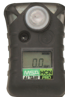
ALTAIR PRO HCN Fire Single-Gas Detector