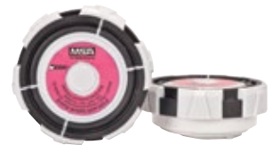
P/N 10146939 P100 Filters with Splash Guard

Please note: the Advantage 290 is approved for use with Advantage style particulate filter cartridges only. It is not approved for use with flexi, chemical or combination cartridges.