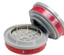
P/N 815369 P100 Filters