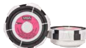
P/N 10146939 P100 Filters with Splash Guard

Note: This Bulletin contains only a general description of the products shown. While product uses and performance capabilities are generally described, the products shall not, under any circumstances, be used by untrained or unqualified individuals. The products shall not be used until the product instructions/user manual, which contains detailed information concerning the proper use and care of the products, including any warnings or cautions, have been thoroughly read and understood. Specifications are subject to change without prior notice.