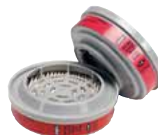
P/N 815369 P100 Filters