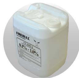
FIREBULL CLASS A WETTING AGENT