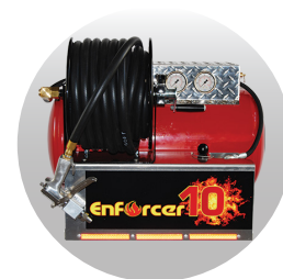
ENFORCER 10 CAFS