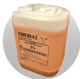
FIREBULL FLUORINE FREE FOAM