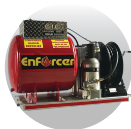
ENFORCER 30 CAFS