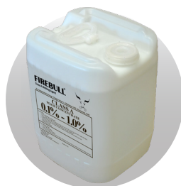
FIREBULL CLASS A WETTING AGENT