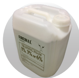
FIREBULL TRAINING FOAM