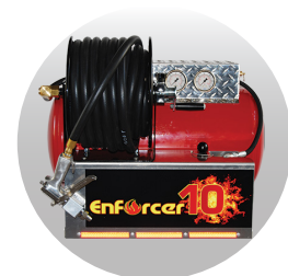
ENFORCER 10 CAFS