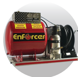
ENFORCER 30 CAFS