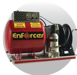
ENFORCER 30 CAFS