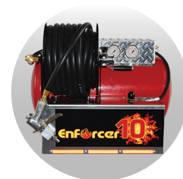
ENFORCER 10 CAFS