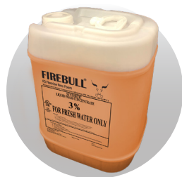
FIREBULL FLUORINE FREE FOAM