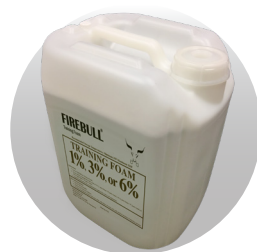
FIREBULL TRAINING FOAM