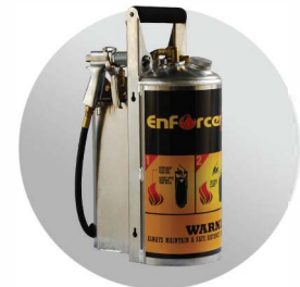
ENFORCER 3 SUPER DUTY