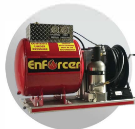
ENFORCER 30 CAFS