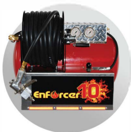
ENFORCER 10 CAFS