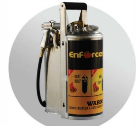
ENFORCER 3 SUPER DUTY