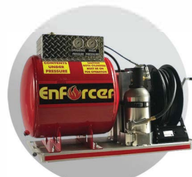
ENFORCER 30 CAFS