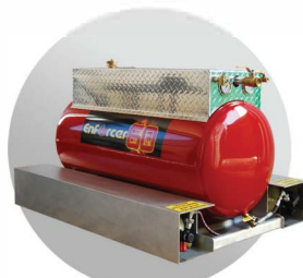
ENFORCER 60 CAFS