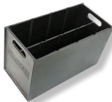
BLACK CARGO BIN FOR BASES HOLDS SIXTEEN - 6 IN / 15.2 CM BASES

Net Weight: 26.4lb 12.0kg Part No. 22-700351