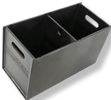
BLACK CARGO BIN FOR BASES HOLDS FOUR - 12 IN / 30.5 CM BASES

Net Weight: 12.0lb 5.4kg Part No. 22-890015