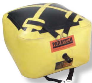
TRENCH CUSHION 18 IN / 45.7 CM LIFT: 3.3 US TON / 3.0 METRIC TON

Low pressure square cushions that can fill up to an 18 in (46 cm) void.