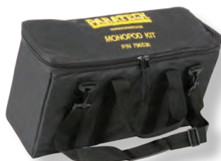
CARRYING CASE, MONOPOD/PULLEY KIT

Net Weight: 0.8lb 0.8kg Part No. 22-796185A