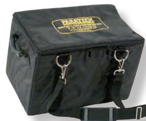
CARRYING CASE, BIPOD KIT

Net Weight: 6.0lb 2.7kg Part No. 22-796535