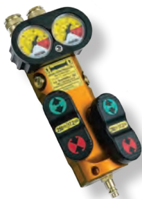
DUAL DEADMAN STRUT CONTROLLER G2 250 PSI / 17.2 BAR Net Weight: 4.1lb 1.9kg Part No. 22-796103G2