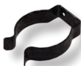
CLIP 3.0 / 7.6 CM (for AcmeThread & LockStroke Struts)

Net Weight: 27.7lb 12.6kg Part No. 22-700352