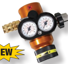
STRUT/AIRGUN REGULATOR 5,500-0 PSI / 379.2-0 BAR Part No. 22-895400G2 US Net Weight: 3.8lb 1.7kg Part No. 22-895400DG2 METRIC Net Weight: 3.9lb 1.8kg