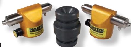
L-TRENCH ADAPTER SET

Net Weight: 28.0lb 12.7kg Part No. 22-887060