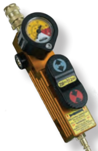
SINGLE STRUT CONTROLLER G2 250 PSI / 17.2 BAR Net Weight: 2.5lb 1.1kg Part No. 22-796100G2