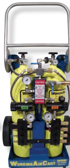
WORKING AIR CART

Net Weight: 8.4lb 3.8kg Part No. 22-796425