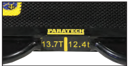
EASY AND ACCURATE POSITIONING