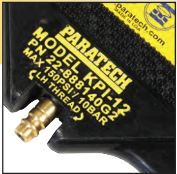
RECESSED AIR INLET FOR ADDED DURABILITY