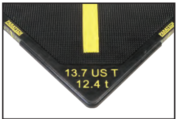
HIGH VISIBILITY MARKINGS