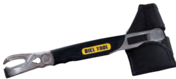
Biel Tool and Sheath Length: 15.1 in 38.3 cm Net Weight: 3.4 lb 1.5 kg Part No. 22-000551