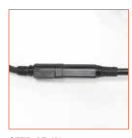
STEP 15 (A)