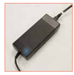
STEP 15 (B)