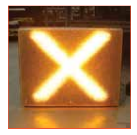
"X" DISPLAYED ON SCREEN