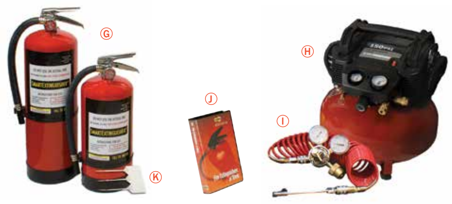
*NFPA IS A REGISTERED TRADEMARK OF THE NATIONAL FIRE PROTECTION ASSOCIATION, INC.

Lock your extinguisher handles in place for a realistic training experience with these tamper seals. Seals come 500 per package.